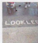
Why you should look both ways before crossing San Francisco streets