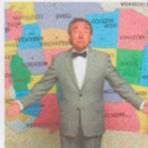
Will Durst: What if the U.S. had to move...