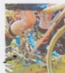
A snapshot from a festival on wheels