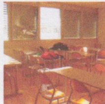
Oakland teacher turned activist rallies...