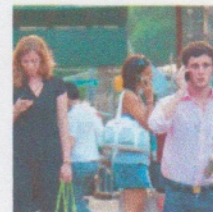
If you can hear me now, you might be in...