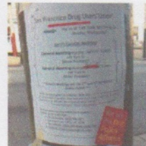
Why drug users are uniting in San Franci...