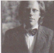
Meet the "thinking man's conce...